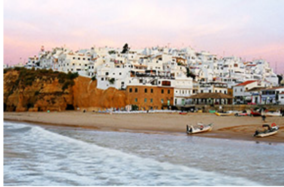
Portugal's flawless beaches and dramatic Atlantic coastlines have a Mediterranean feel...

Check out the copy below or go to the link: http://liveandinvestoverseas.com/conf/portugal-conference/