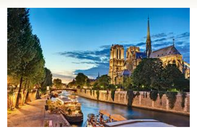
Yes, it's true: You can enjoy the best of the Old World with as little as US$1,500 per month...