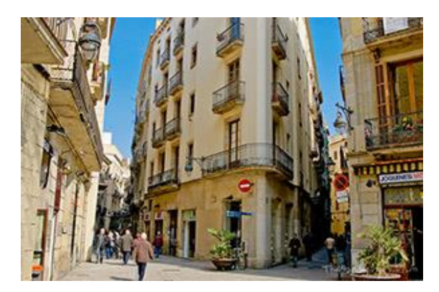
Enjoy some of the Mediterranean's best cosmopolitan cities for only a few hundred dollars a week or less...

We get it... Europe has never been the place to seek out the world's least expensive overseas living options. However, you'll be surprised at the number of affordable areas—including at least four that are UNBELIEVABLY budget-friendly—awaiting you in Europe.