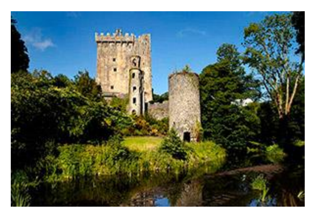
Right now, you have more options for affordable living in Europe than you probably ever thought possible...

Castles? Mountains? Beaches? Vineyards? Roman bridges? Old stone houses? Quaint shops? World-class museums and theaters? Mouth-watering foods grown or made just down the road? Vibrant cities? Charming villages?