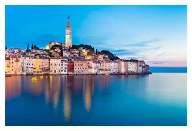
Some of the world's most beautiful and culture-rich destinations are on sale right now thanks to favorable currency exchange rates...

You'll definitely have to keep pinching yourself... as you discover the incredible real estate bargains and investments that continue to come into play as you make your way through the Discover Europe Kit .