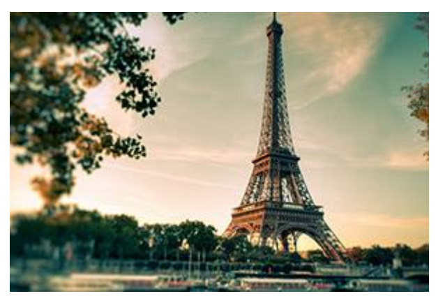
This is the best time in a decade to be a dollar holder... your money simply buys you more in Europe right now...