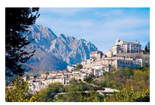
Learn about our top choice in Italy, an under-the-radar coastal region with mountain vistas that costs significantly less than the more well-known locales...

Nowhere else in the world can you stretch your retirement dollars to get the quality and richness of lifestyle you get in Europe.